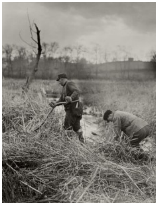
Figure 6: Mowing hay in Flushing meadows, 1906.