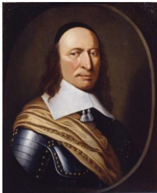
Figure 2: Petrus Stuyvesant, n.d. Artist unknown. Oil on wood. Courtesy of the New-York Historical Society, gift of Robert Van Rensselaer Stuyvesant, 1909.2.