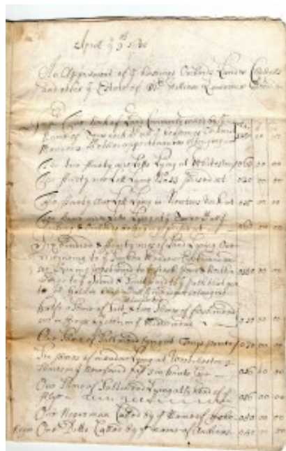
Figure 4: Page from the Flushing inventory of William Lawrence itemizing slaves and landholdings on Long Island and in Westchester, 1680.