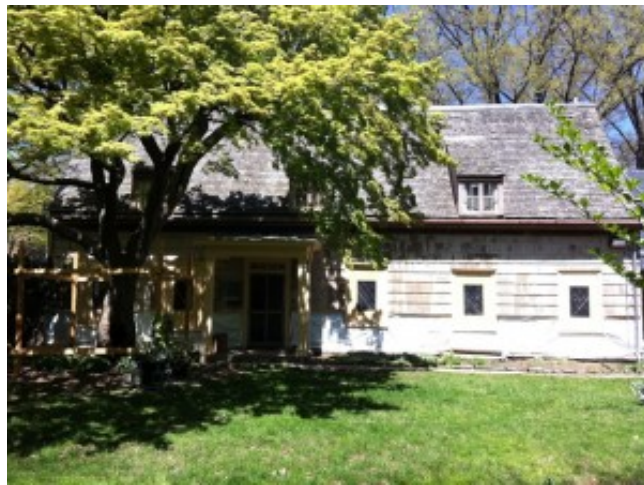
Figure 3: John Bowne House, Flushing, NY, May, 2013.