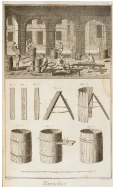
Figure 7: Coopers shaping staves and assembling casks. “Tonnelier,” Plate 1. Recueil de planches sur les sciences, les arts liberaux, et les arts mechaniques : avec leur explication. Paris: Chez Briasson : David : Le Breton : Durand, 1762- 1772.